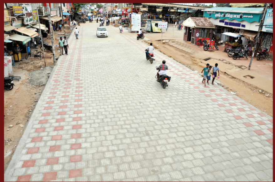
National Highways Authority of India - NH 210

Thus it is resulted to impressive, long lasting life and zero maintenance cost of surfacing materials to world class streets and carriage way.