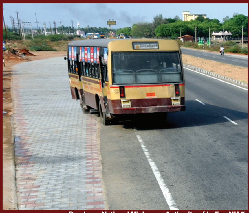
Bus bay - National Highways Authority of India - NH 7