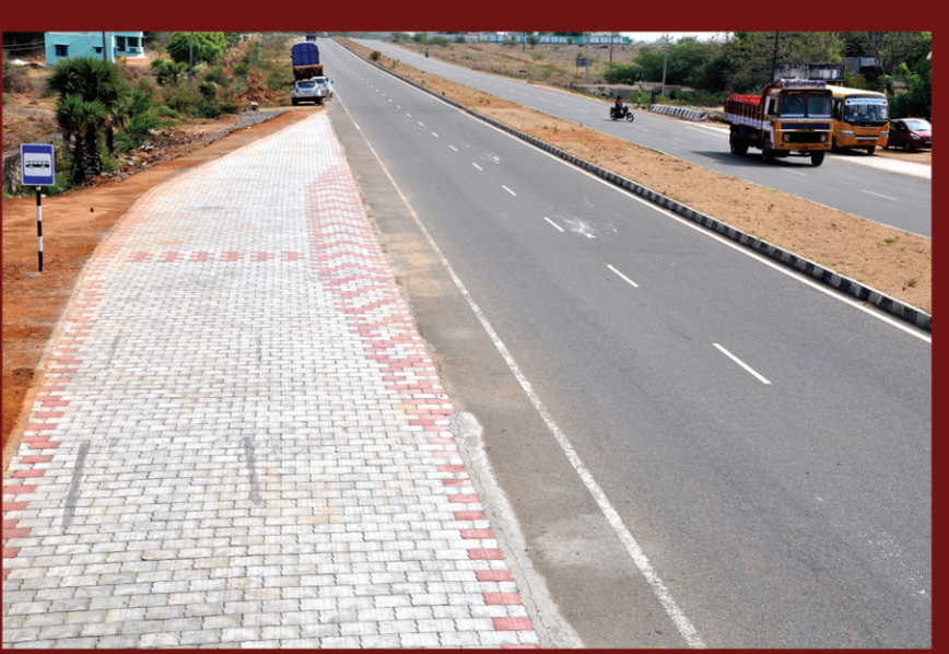
National Highways Authority of India - NH 7